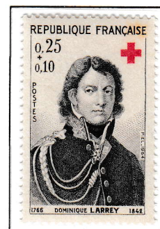
Dominique Larrey (Military doctor)