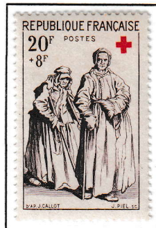
One-eyed and beggar