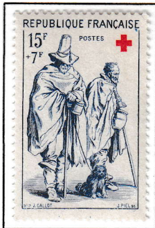
Blind and beggar (Jacques Callot 1592-1635)