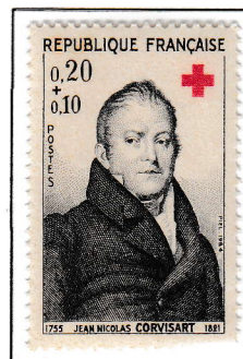
Jean Nicolas Corvisart (French Physician)